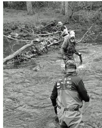
Volunteers in Action

A general email will be sent to the membership in advance of June 11 th , but if you are not on our email distribution list (about one-third of our membership), then please mark your calendars and join us at 8:30 at the Nolt family's property on Dairy Road for a couple hours of tree planting and assorted streambank restoration work. Park at the North Cornwall Township athletic field which is directly across the street from the TU project.