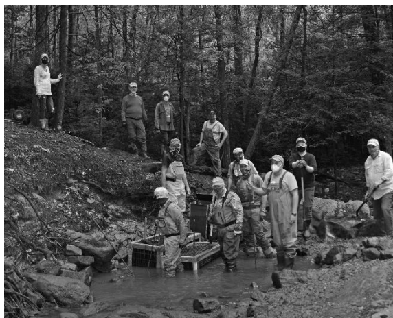
Does this remind you of the California gold rush?