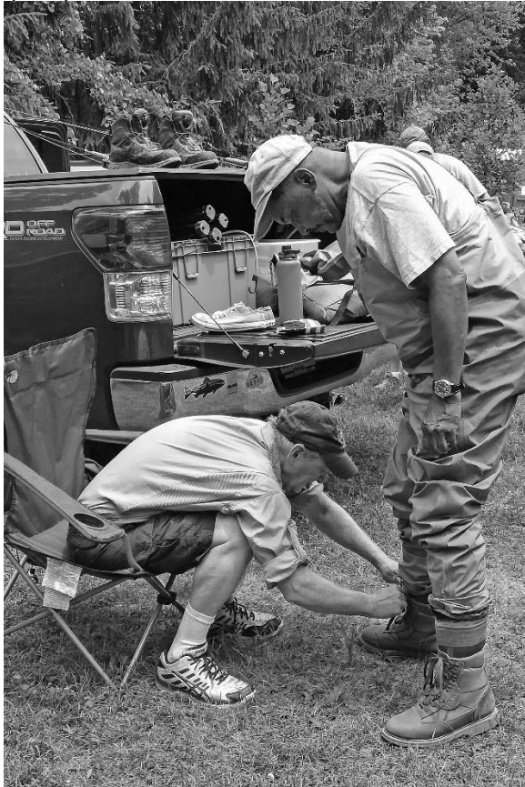
A Veteran Getting Fitted with Waders and Boots