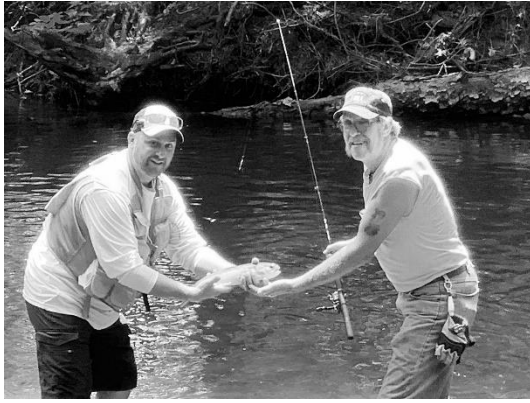
A Successful Day on Clarks Creek