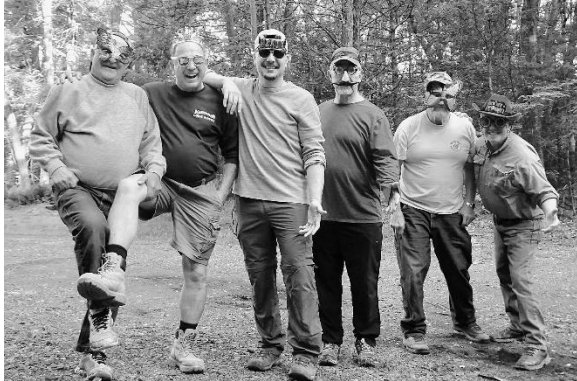
Masks were appropriate on this June evening